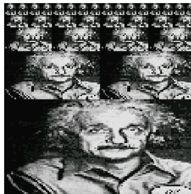
(up-split einstein 4)