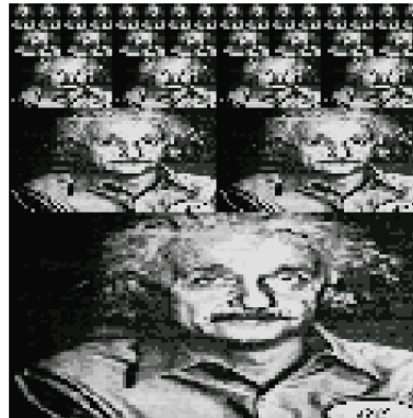
(up-split einstein 4)