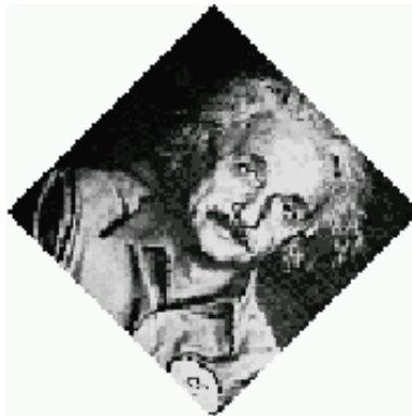
Figure 2: Painting created by ( diamond einstein ).

http://linux.tucows.com/preview/10306.html ). Crop to get a (reasonably) square region. (In Linux: Mouse1 and drag in xv, then right-click to open the xv controls window.) Reset image size to 128x128 pixels (In Linux: Image Size > Set Size, enter 128x128 and click Ok in xv.) Save as a greyscale .gif file as my-pic.gif (color .gifs will not work with this problem set, dithered b/w .gifs have not been tested with this problem set).