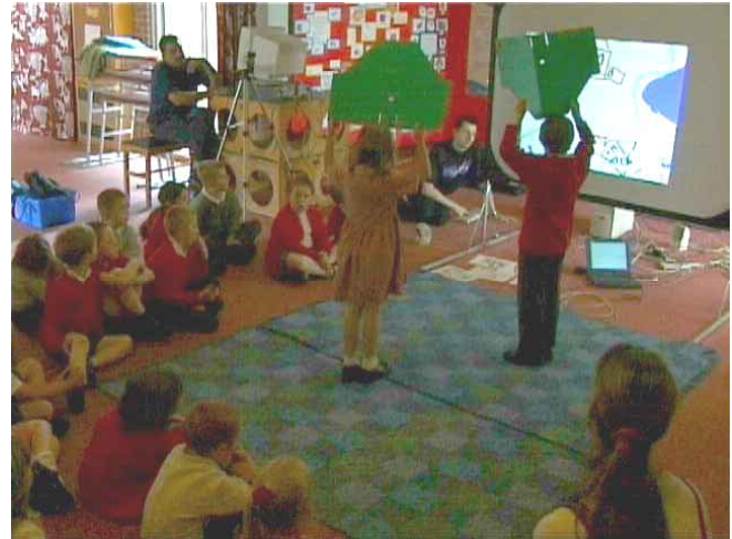
Figure 6: video-tracked props used to control vertical movement when enacting a story (see color plate on page 00)

Initially the props used were plain shapes. However, the class discussed the use of different shapes (see figure 6 for an example), such as an umbrella, kite or a balloon for movement upwards. It proved more difficult to think of objects for moving downwards; some examples included a spade, a parachute and a fish. The teacher and researchers also explained to the class that it may be difficult to use a shape such as an arrow or a pointing finger as they may be picked up upside down.