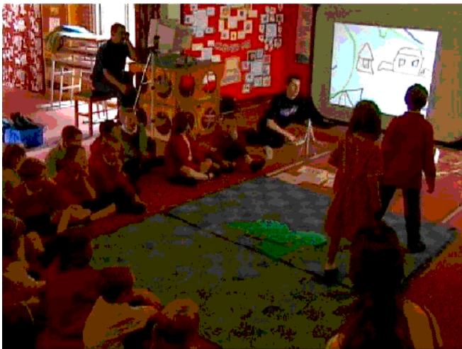
Figure 8: Children presenting their story to the whole school (see color plate on page 00)

In the last two school sessions pairs of children used the magic carpet, barcodes and bar-coded and video tracked props in combination to re-tell a story using KidPad. Children gave the rest of the class, who acted as the audience, a guided tour of the island where the story was set, narrating the different places and objects visited (see figure 8). The barcode tended to be a faster method of navigating to a specific point, once this point had been reached; the children would then use the magic carpet to make fine movements around and into the object they had reached. The teacher commented that this may be especially well suited for retelling a story to keep an audience involved, and that this method of ‘jumping’ around the screen seemed to be more obvious and easier to use than the process of setting up arrows to join story elements and then traveling through a set sequence of arrows as is used with the traditional KidPad set up.