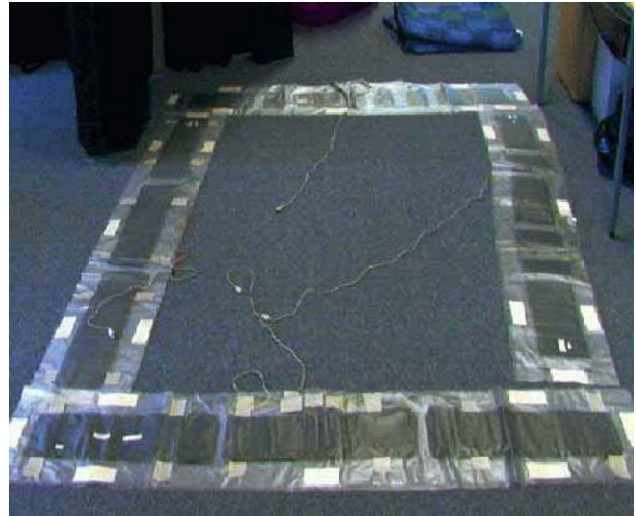
Figure 4: the design of the sensor pads for the third prototype magic carpet (see color plate on page 00)

presented to the children at the next school session. It dramatically changed the way in which the children interacted with the carpet. Instead of jumping with both feet on to the squares, the children carefully placed one foot onto an arrow. This meant that they usually did not put enough weight on the arrow in order to move in the environment, and subsequently did not understand why this action did not have the expected effect. In short, it appears that apparently superficial changes to the appearance of the carpet resulted in quite different physical interactions.