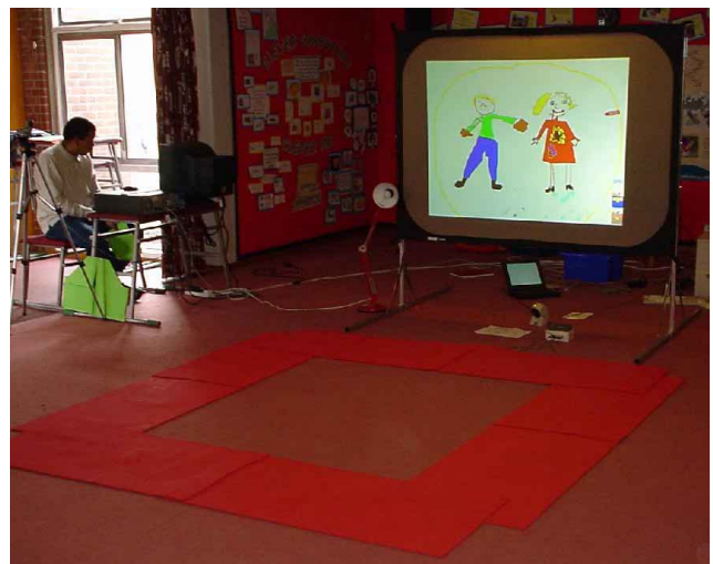
Figure 5: third prototype of the magic carpet with mats around the outside edge only (see color plate on page 00)

Our most recent design incorporates features to make the carpet easier to deploy within a classroom and to integrate with other activities. The carpet has a modular design. Underneath are the pressure pads, grouped into blocks of three and encased in plastic so as to be rugged (figure 4). These blocks can be positioned on the floor as required. If space is available (the carpet needs to be used in a variety of rooms from crowded classrooms to large halls), a larger