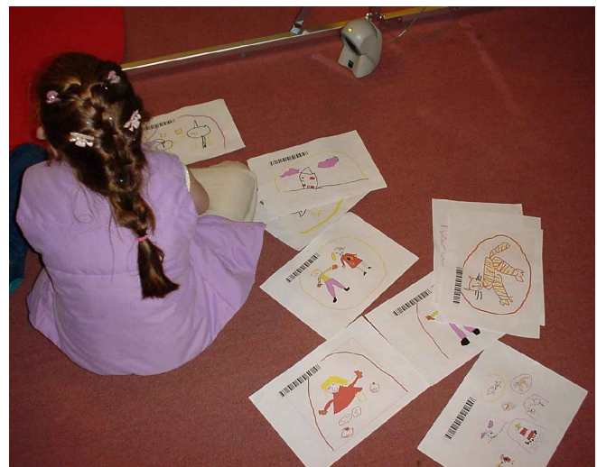
Figure 7: Navigation using barcoded pictures (foreground) and barcode reader (background) (see color plate on page 00)