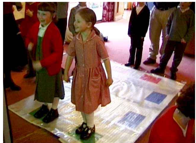
Figure 2: second prototype magic carpet with rectangles to show positions of sensor pads (see color plate on page 00)